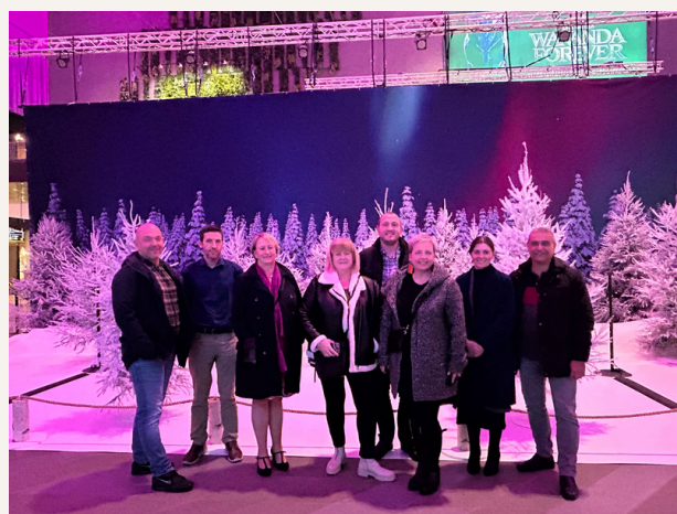
Getting used to the weather in Finland.