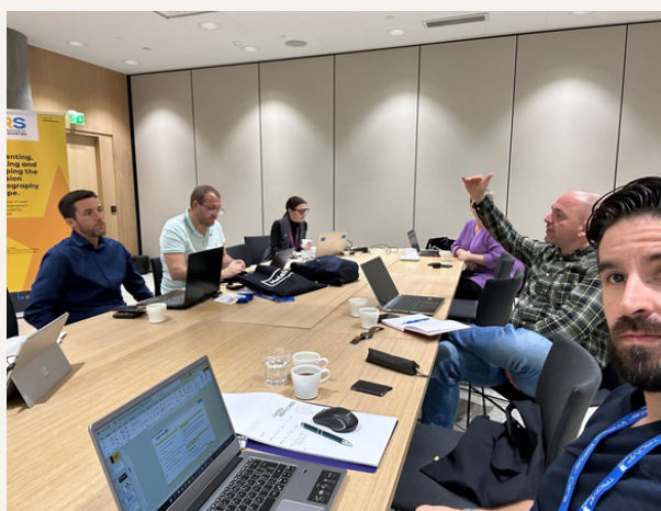
EFRS Executive Board and Staff preparing the future