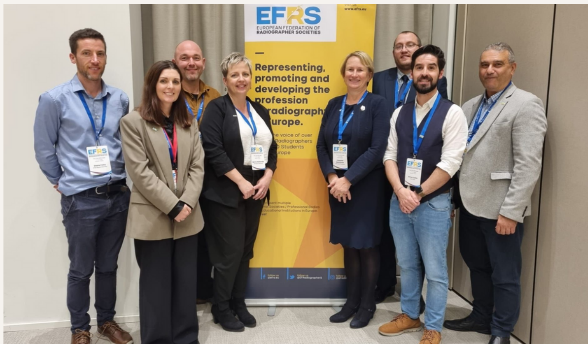
The EFRS Board and EFRS Staff.